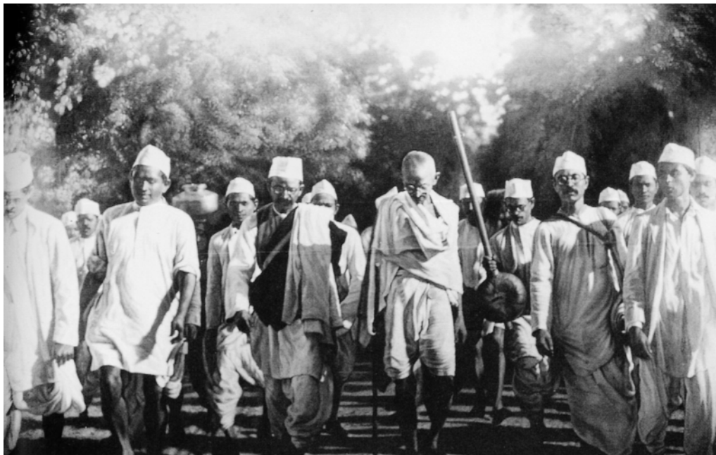
3. Gandhi on the Salt March, 12 March 1930