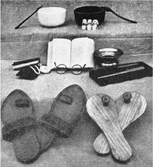
7. Gandhi's worldly possessions