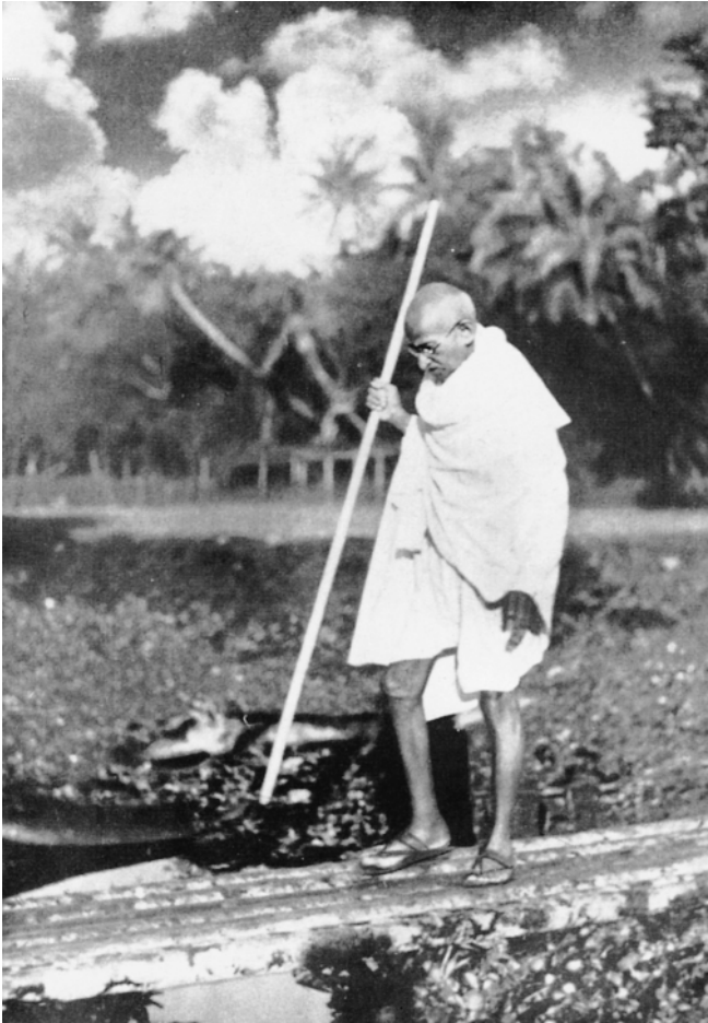
4. Gandhi walking through the riot-torn areas of Noakhali, late 1946